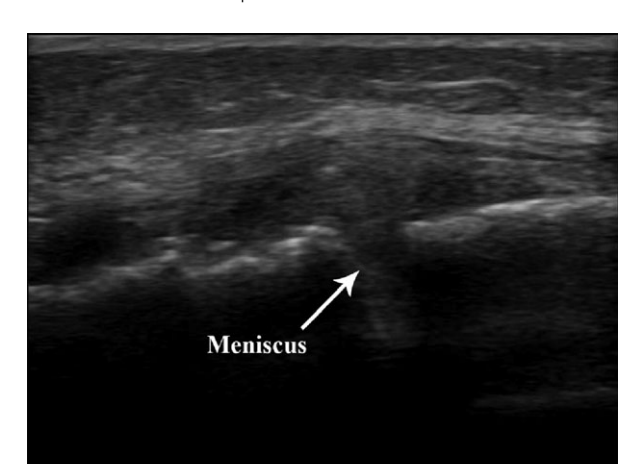
Figure 1. Ultrasound image of a meniscus with degenerative fraying, taken from a medial viewpoint.

Figure 2. Ultrasound image of a needle being inserted directly into the parameniscal area, captured from a medial viewpoint.